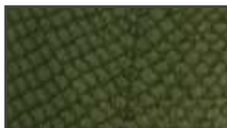
Olive: coated LL1027 uncoated LL1127 hydro LL1227