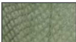
Reed: coated LL1009 uncoated LL1109 hydro LL1209