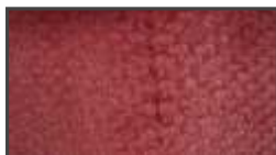
Bordeaux: coated LL1029 uncoated LL1129 hydro LL1229