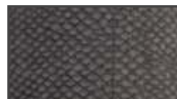
Platin: coated LL1028 uncoated LL1128 hydro LL1228