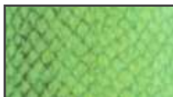
Lime: coated LL1012 uncoated LL1112 hydro LL1212