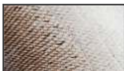
Nature: coated LL1000 uncoated LL1100 hydro LL1200