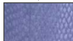
Ice: coated LL1007 uncoated LL1107 hydro LL1207