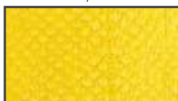
Lemon: coated LL1015 uncoated LL1115 hydro LL1215