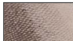
Mimosa: coated LL1002 uncoated LL1102 hydro LL1202