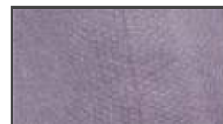
Lavender: coated LL1024 uncoated LL1124 hydro LL1224