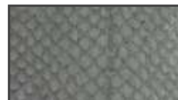
Grey: coated LL1021 uncoated LL1121 hydro LL1221