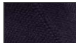
Black: coated LL1022 uncoated LL1122 hydro LL1222