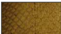
Cognac: coated LL1020 uncoated LL1120 hydro LL1220