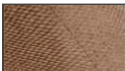
Chestnut: coated LL1001 uncoated LL1101 hydro LL1201