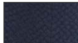
Marine: coated LL1006 uncoated LL1106 hydro LL1206