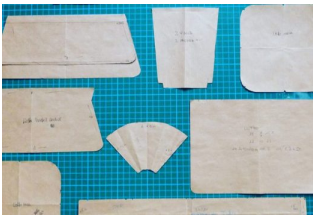
Every bag starts with a pattern