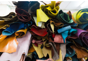
Vegetable tanned leather – durable and environmentally-friendly